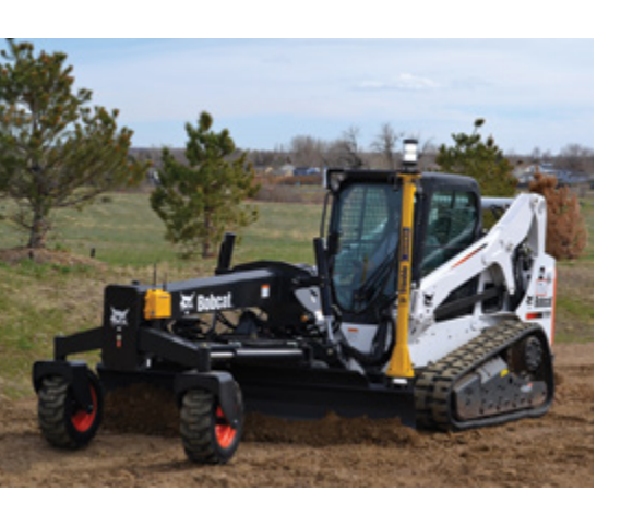
Bobcat with HD Grader Attachment and Trimble GCS900 Grade Control System with Universal Total Station